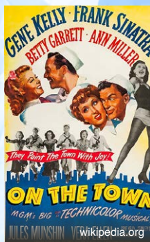
On The Town film poster

Garland plays Hannah Brown, an aspiring performer in Easter Parade (1948), opposite Fred Astaire who plays Don Hewes, a famous dancer trying to turn her into a star. Together, they perform A Couple of Swells , a vaudeville-style number. Written by Irving Berlin, the song captures the movie's theme: a satire about wealth and social class.