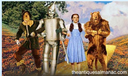
Scene from The Wizard of Oz

Harold Arlen's Somewhere Over the Rainbow is the iconic ballad sung by Dorothy (played by Garland) early in The Wizard of Oz (1939), as she dreams of a world beyond her life in Kansas, where her troubles disappear. An expression of hope, yearning and innocence, wrapped in an almost lullaby-like melody, this simple yet powerful song captures the universal desire to escape hardship and find something better. The song won an Oscar for Best Original Song in 1939.