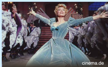
Scene from Can-Can

Cole Porter's Adam And Eve Ballet is a dance sequence from the film Can-Can , choreographed by Michael Kidd. In the 1960 film adaptation, Sinatra played François Durnais, a lawyer who is in love with the dancer played by Shirley MacLaine. The song is a stylised tale of Adam and Eve, presented with a comedic and satirical twist.