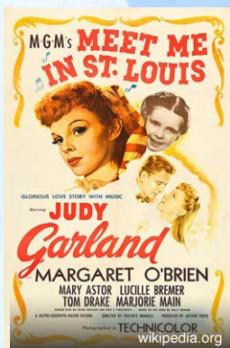
Meet Me In St. Louis film poster

A nostalgic celebration of train travel and American culture, On the Atchison, Topeka And The Santa Fe (composed by Harry Warren with lyrics by Johnny Mercer) was written in 1944 for the 1946 musical The Harvey Girls , in which Garland starred, alongside Angela Lansbury and Virginia O'Brien. The song became a major hit, winning an Oscar for Best Original Song (1946). It was also recorded by other singers including Harry Connick Jr., Rosemary Clooney and John Denver, capturing its enduring appeal and catchy melody.