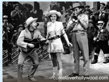
Scene from Girl Crazy

From the movie Girl Crazy (1943), Garland performed I Got Rhythm - composed by George Gershwin with lyrics by Ira Gershwin - singing this energetic number alongside Mickey Rooney in the last of their nine movies as co-stars. The film was based on the stage musical of the same name, written by Guy Bolton and Jack McGowan, with music and lyrics by George and Ira Gershwin. Meanwhile, It's All Right With Me , written by Cole Porter, is from the film Can-Can (1960), with the tune sung by Sinatra.