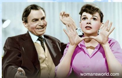
Scene from A Star Is Born

From Kiss Me Kate (1953), comes two songs composed by Cole Porter. From This Moment On (sung by Ann Miller, Bobby Van, Tommy Rall and Bob Fosse) is a dazzling dance number while So In Love , sung by Kathryn Grayson, is a romantic ballad about a deep but conflicted love. Sinatra recorded From This Moment On in 1957 for his album, A Swingin' Affair! while So In Love appeared in several of Sinatra's albums over the years.